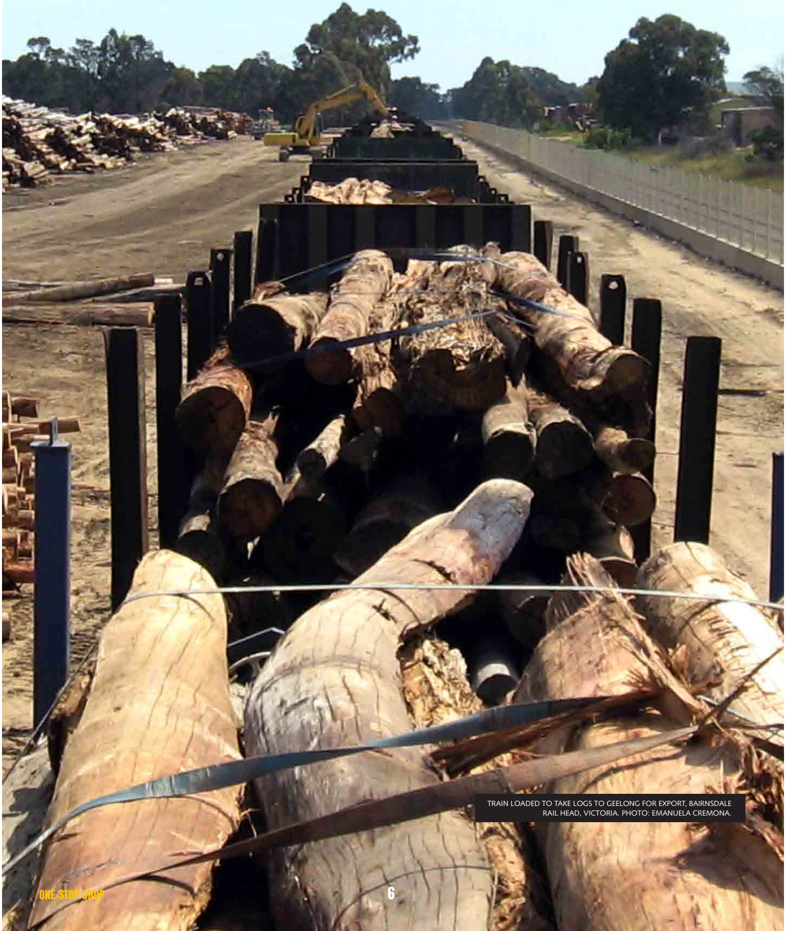
TRAIN LOADED TO TAKE LOGS TO GEELONG FOR EXPORT, BAIRNSDALE RAIL HEAD, VICTORIA.