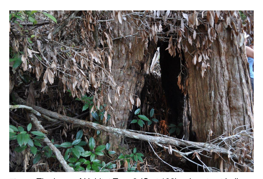
Fig 3: The base of Habitat Tree 3 (C.pt 136): a burnt out hollow, now surrounded by and filled with debris, waiting to be annihilated in the post logging burn. GPS: 56J 048261; UTM 6499780