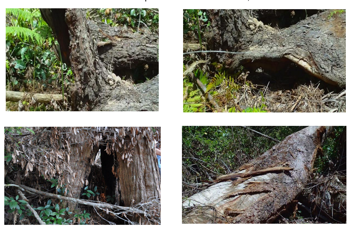
Fig 5: 1 (b): Details of felled tree above, below rocky escarpment, C.136 GPS: 56J 0458911; UTM 6500571

Habitat Trees/Stags Felled This felled stag (Fig 6 (a), was in far better condition than most habitat trees left remaining. At least it has a semi solid base, instead of being just a burn out hollow with butt damage, as for example, Habitat Tree 4, Fig 6 (b)