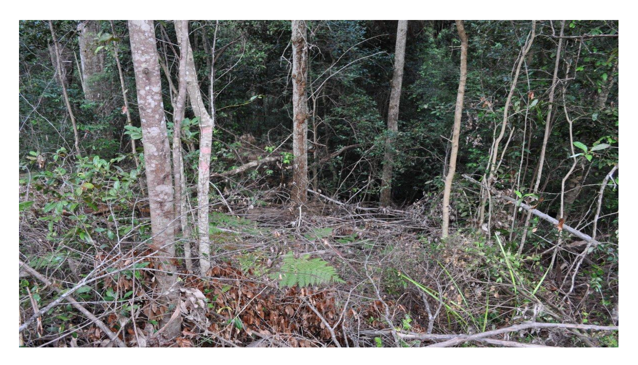
Fig 10: Trees felled into rainforest and stuttering frog habitat drainage line exclusion zone