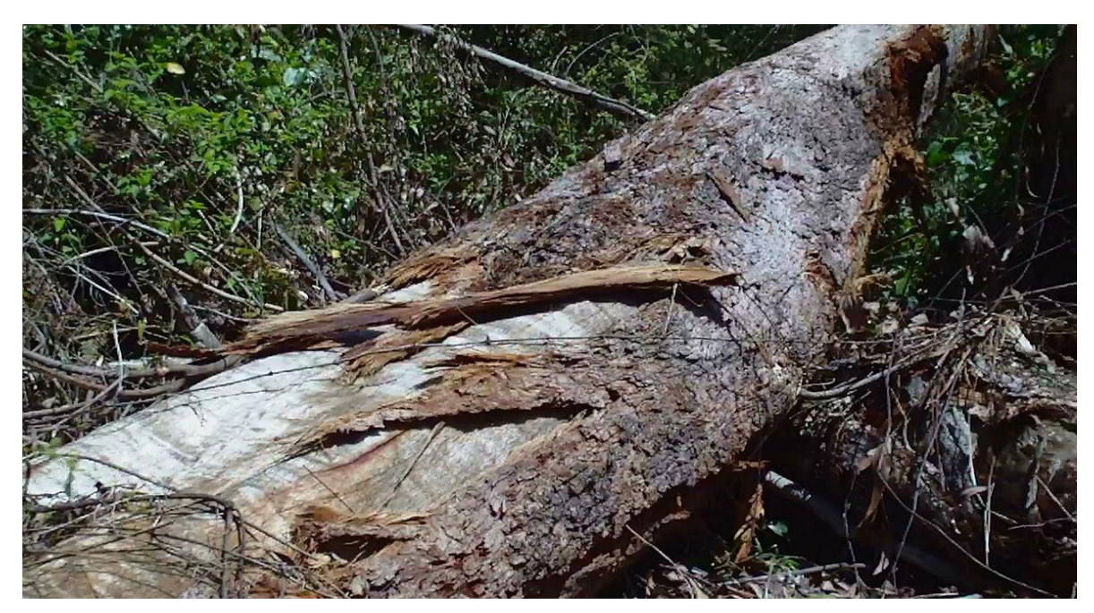
Fig 4: 1 (a): Below rocky escarpment C.136: Cut, abandoned trunk of un-marked, potential habitat tree now useless for arboreal species. GPS: 56J 0458911; UTM 6500571

Trees that could have provided habitat lie felled, abandoned, not marked, not retained, not used