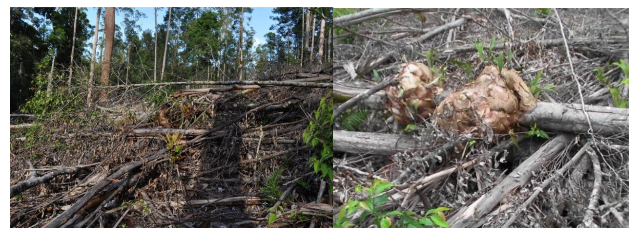
Figs 17, 18: This exclusion zone boundary is meant to protect endangered rainforest. Note the buttressed rainforest species with epiphytes clinging to branches. In the middle of the piled debris of marginal species, r/f species are piled to be destroyed in the post log burn. GPS 56J 0458962; UTM 6500783.