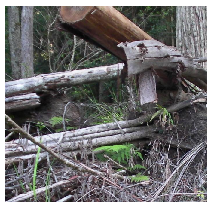
Fig 15: Treatment typically afforded to currently unfashionable rainforest species. 30-40% of these forests is export pulp. BORAL business plan is to expand pulp harvest for various uses including composite wood products. Fine timbers for cabinet making and the various complex uses possible from mixed species forests are not required by multinational with extraction licence, hence the destruction. Note: Far right lower corner newly germinating C.camphora will invade forest if burn doesn't consume all.