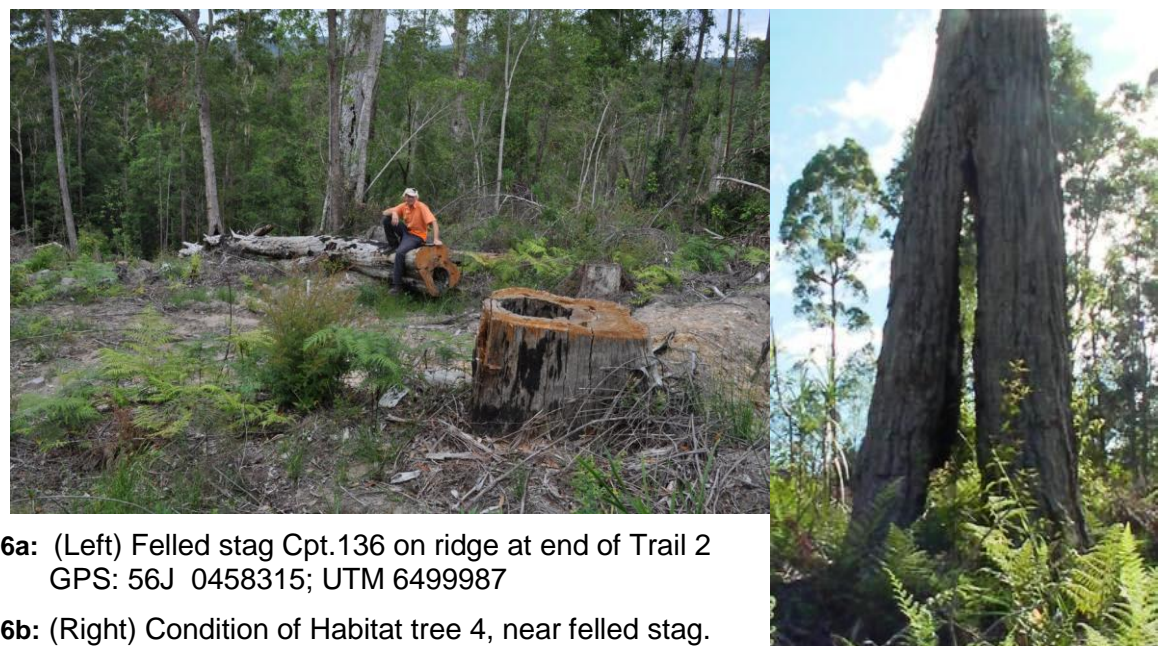
Fig 6a: (Left) Felled stag Cpt.136 on ridge at end of Trail 2

Fig 6b: (Right) Condition of Habitat tree 4, near felled stag.