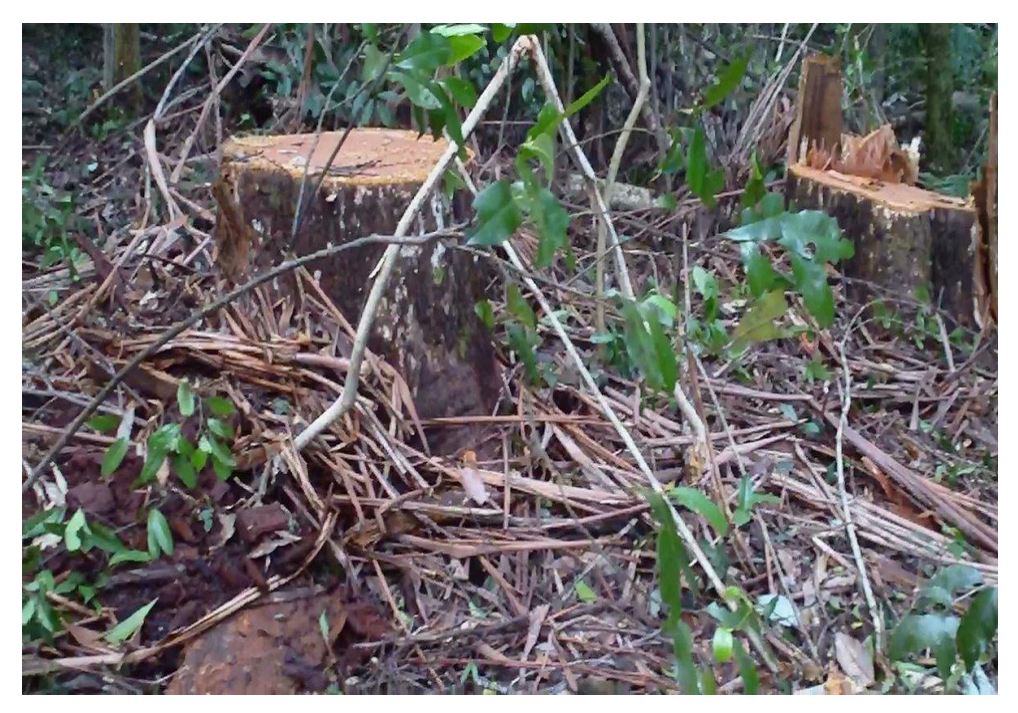
Fig 12: Compartment 136: Recorded 13/11/2010:

Along the northern boundary of Cpt.136, below the rocky outcrop, where multiple trees were pushed into 30 metre drainage line exclusion area, not only were marker trees felled, but multiple trees pushed into 3 bar exclusion areas. GPS 56J 0458962; UTM 6500783. At least 5 logs were also cut within this exclusion zone. GPS 56J 0458947; UTM 6500761.