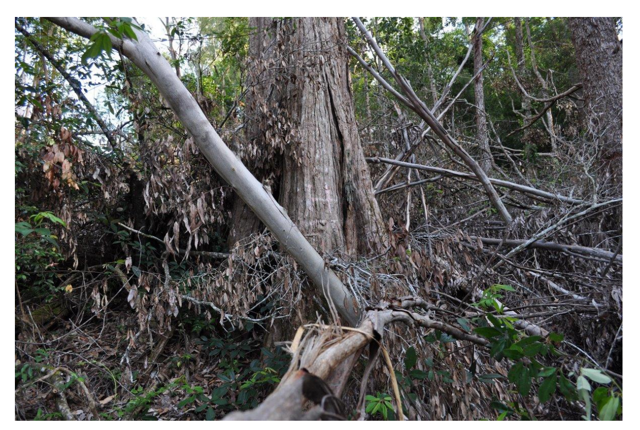
Fig 2: Habitat Tree 3, Cpt.136 GPS: 56J 048261; UTM 6499780.

Non removal of logging debris from the perimeter of habitat trees – this was the norm, never the exception. Not one instance occurred where the base of a habitat tree was free from debris. In almost all cases habitat trees were completely surrounded by logging debris, comprising dead trunks, crowns, branches and leaves. Often debris was in piles metres high around habitat trees. There appears to be a deliberate intent to facilitate their burning in the post-logging burn.