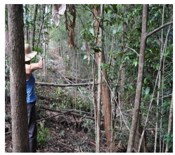
Fig 8: Trees felled into rainforest and stuttering frog habitat drainage line exclusion zone

Photos below trees and debris within exclusion zone along many areas of boundary length.