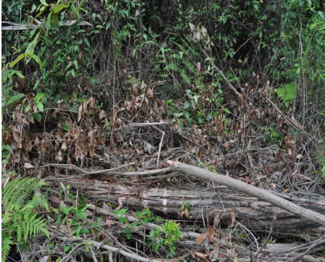
Fig 14: Compartment 135: Recorded 13/11/2010: Exclusion zone marker tree for both 2<sup>nd</sup> order stream and regenerating subtropical lowland rainforest ecotone. Tree has been pushed over (by the roots). Big machinery then marched up the hill smashing regenerating rainforest.