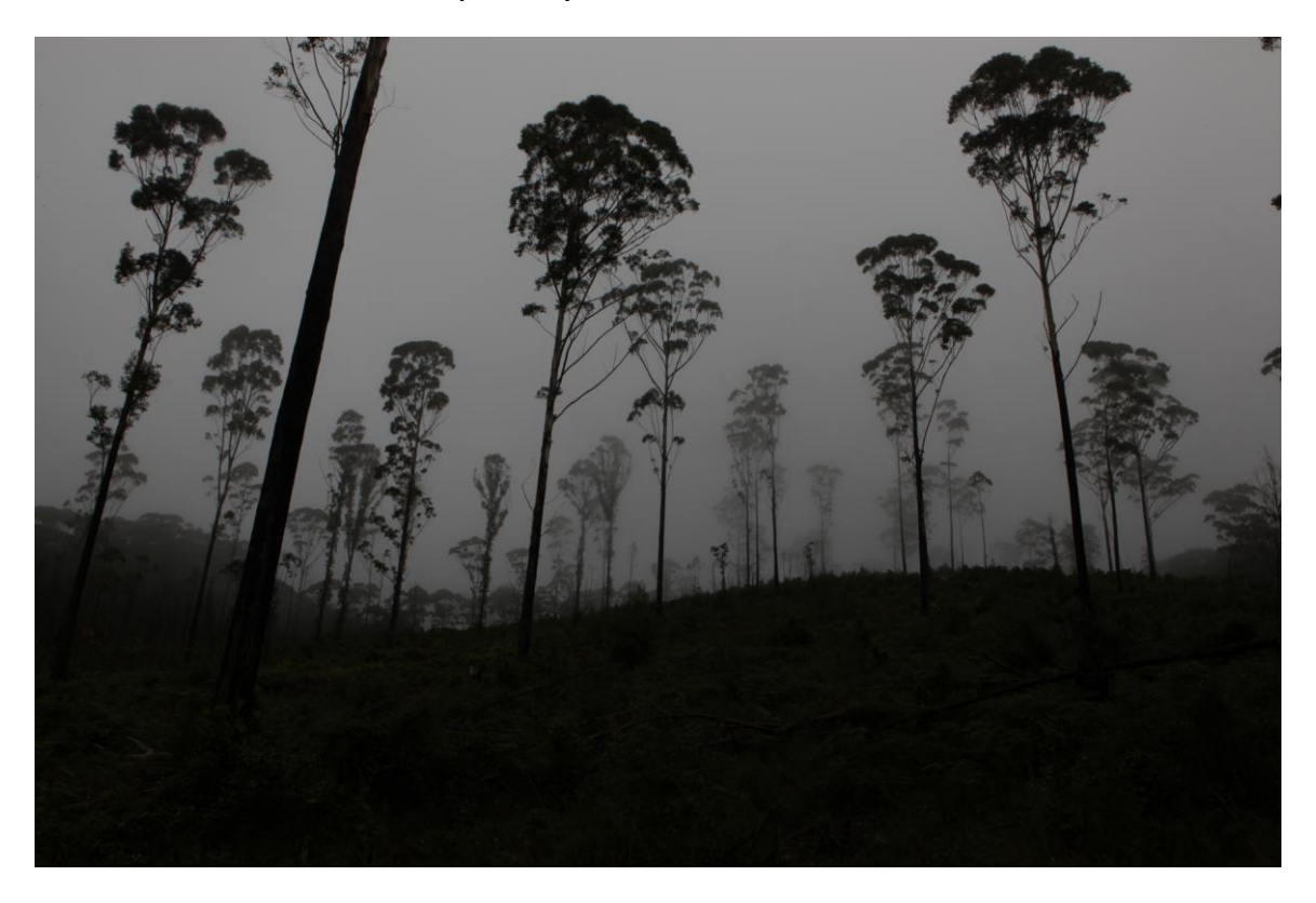
The NSW forestry industry in economic and environmental crisis

Economic/Resource Crisis - In 2004 the NSW Government issued new Wood Supply Agreements for northeast NSW, entrenching further unsustainable logging. During the 2009 review the NSW government removed a a clause that allowed for reductions in commitments in line with yield reviews and in fact allowed for compensation for lack of supply.