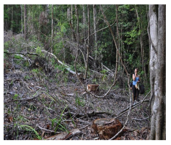
Fig 11: Citizen walks in exclusion zone within which trees have been felled. Cut stumps of trees illegally felled within exclusion are visible to the left of the figure in fore and mid-ground, (right) which is at GPS 56J 0458271; UTM 6499739