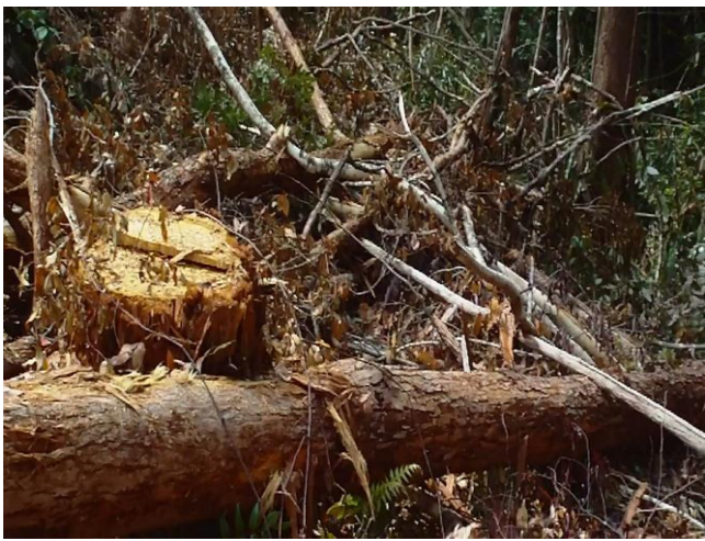
Photo left: 2 bar drainage line mark beyond which multiple felled trees protruded well into Fig 7: drainage line. Photo right: felled trunk continues beyond photo and (soft) exclusion zone to near drainage line centre GPS 56J 0459350; UTM 6500528

Compartment 136: Recorded 13/11/2010: Multiple trees pushed into 3 bar exclusion areas and all along the northern boundary of the section into 40 metre protection zone of ridge/headwater habitat area and 3<sup>rd</sup> order stream. This was apparently deliberate and cannot be attributed to an unavoidable accident. GPS 56J 0458962; UTM 6500783