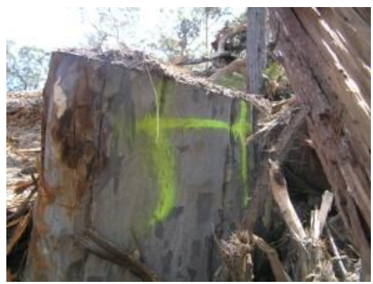
Mogo SF - Habitat Tree 'Retention'

In light of these findings, South East Forest Rescue calls for indigenous ownership of all public native forest, complete transfer of wood product reliance to the plantation timber industry and salvage recycled hardwood timber industry output, a single authority for national native forest stewardship modelled on the New Zealand example and an immediate nation-wide program of catchment remediation and native habitat reafforestation.