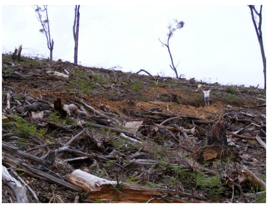
Gnupa SF - 4 trees per 2 hectares. "Gnupa was a mistake": FCNSW

We assert that urgency is needed in this forest reform. In our view, the RFA experiment has failed.