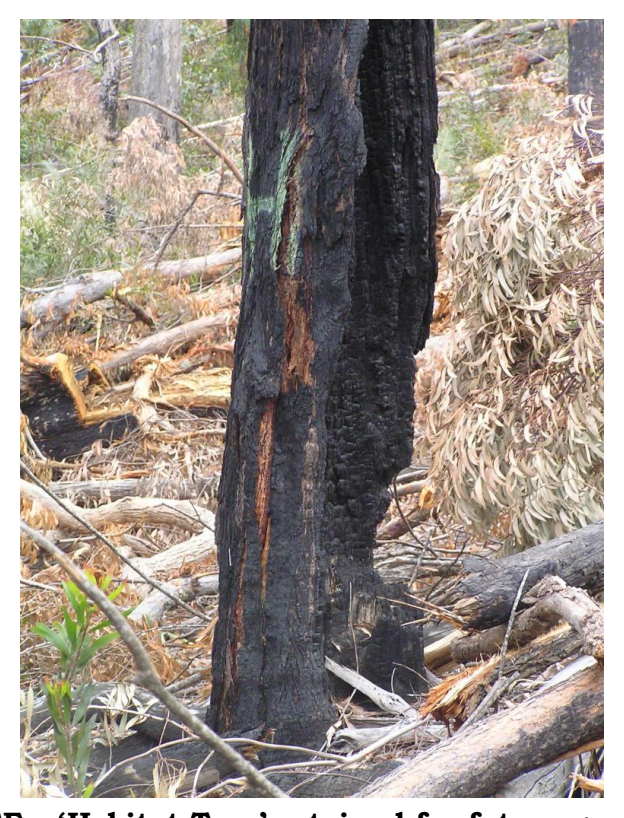
Dampier SF - 'Habitat Tree' retained for future generations...

The change in species composition of ecosystems due to the preferential grazing of palatable species is only one effect from grazing. Cloven-hoofed animals have contributed to soil compaction and general degradation of ecological processes by causing the loss of leaf litter and the associated loss of soil micro-organisms and available carbon, reduced soil water infiltration rates and an increase in soil erosion.<sup>174</sup> These effects are particularly pronounced in temperate woodlands.<sup>175</sup>