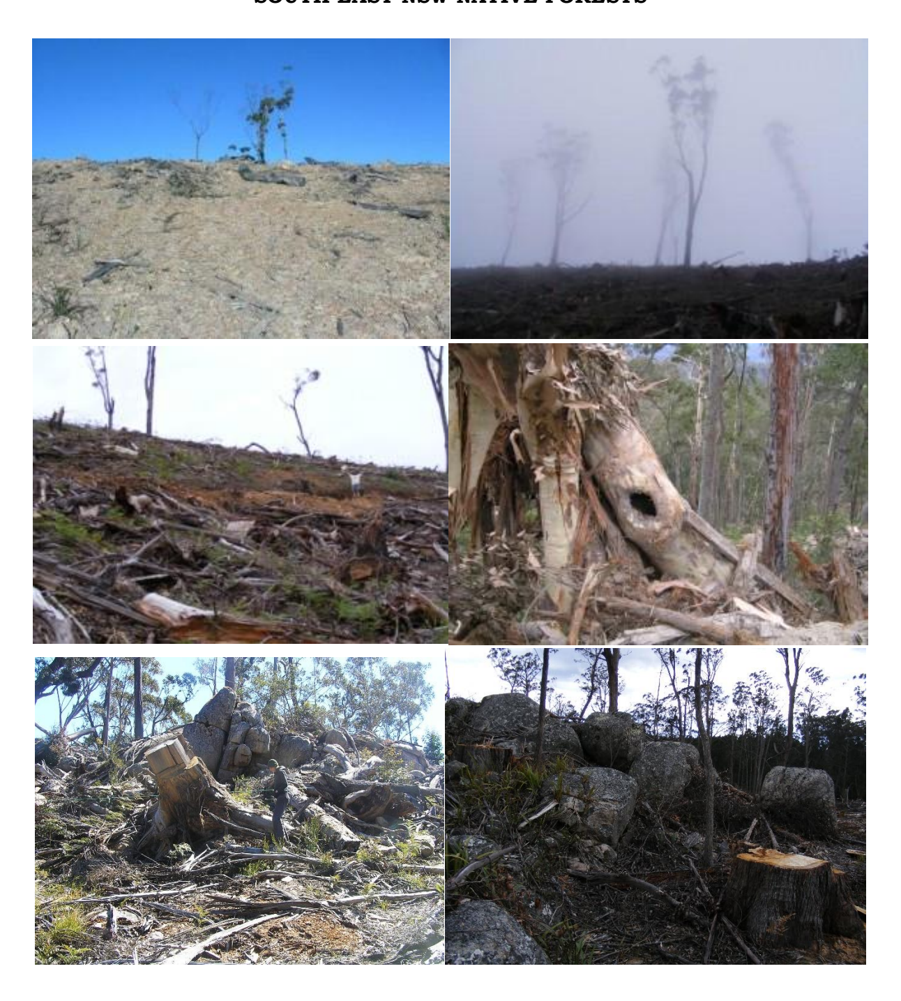
SOUTH EAST FOREST RESCUE - Submission on the RFAs