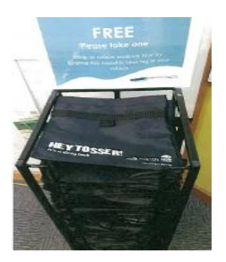
Free, reusable, in-car litter bags will remain at the local visitor centre.