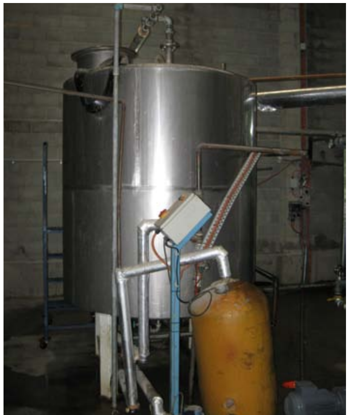
Bulk methylene chloride tank with no placarding

The storage of chlorinated solvents was assessed in this review by examining production areas that work with chlorinated solvents and the areas used to store them.