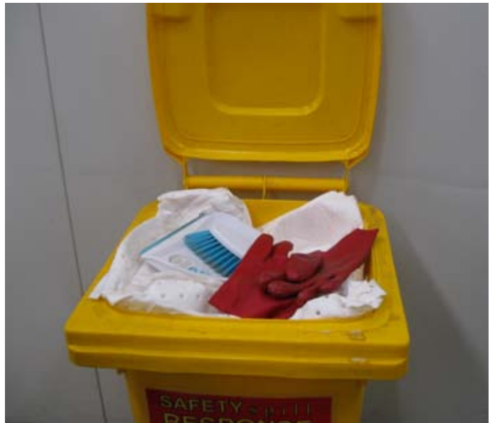
Being prepared for emergencies minimises the risk of harm to the environment from spills or leaks