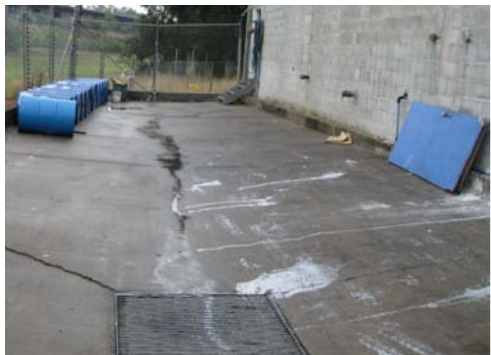
Poorly maintained transfer and handling area for chlorinated solvents with transfer points not labelled and cracks in the concrete floor