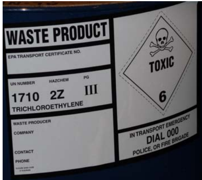
Good example of a label providing the required information on a waste drum containing trichloroethylene