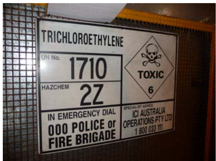
Good example of a placard for trichloroethylene