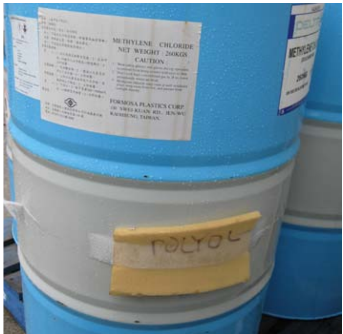
A drum with a label 'Methylene chloride' being reused to store another chemical (polyol)