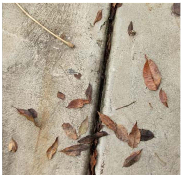
Unsealed expansion joint in concrete