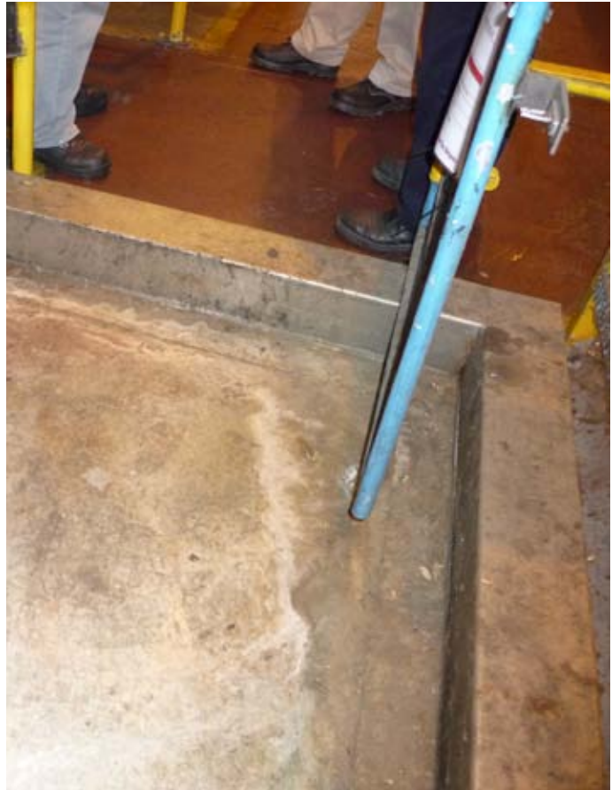
Steel lining on a containment area used to store trichloroethylene