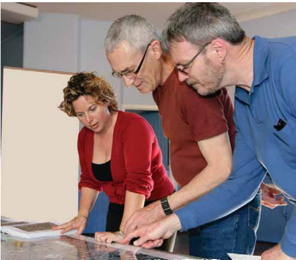
Establishing a good working relationship between the proponent and the community (Transport Infrastructure Development Corporation)