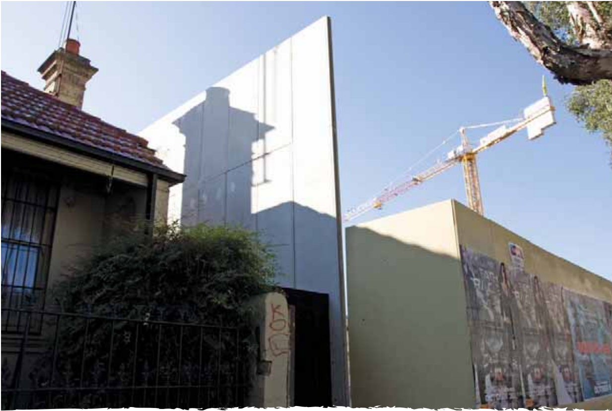
A temporary noise barrier between the worksite and a neighbour (DECC)