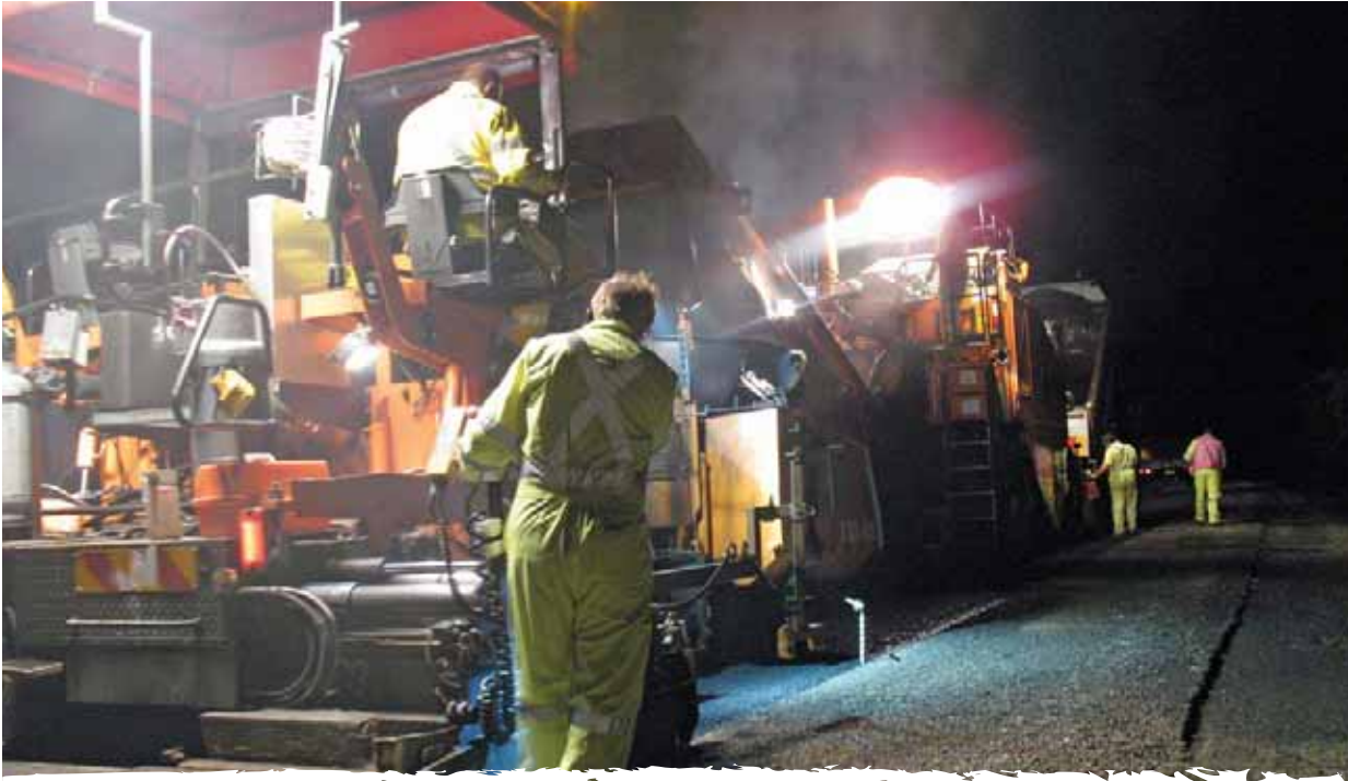
Road maintenance often needs to be done at night