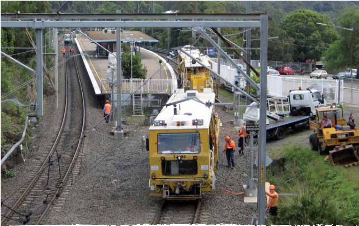
Rail maintenance often involves work in a narrow corridor

The local council is the appropriate regulatory authority for noise from non-scheduled construction activities in its area, except as described in section 6(2) of the POEO Act, and thus has discretion in dealing with noise. Some local councils have their own policy (for example, City of Sydney) whereas other local councils that do not have the resources to develop their own policy often seek guidance from DECC. The Guideline may be of assistance to local councils in guiding their decision making.