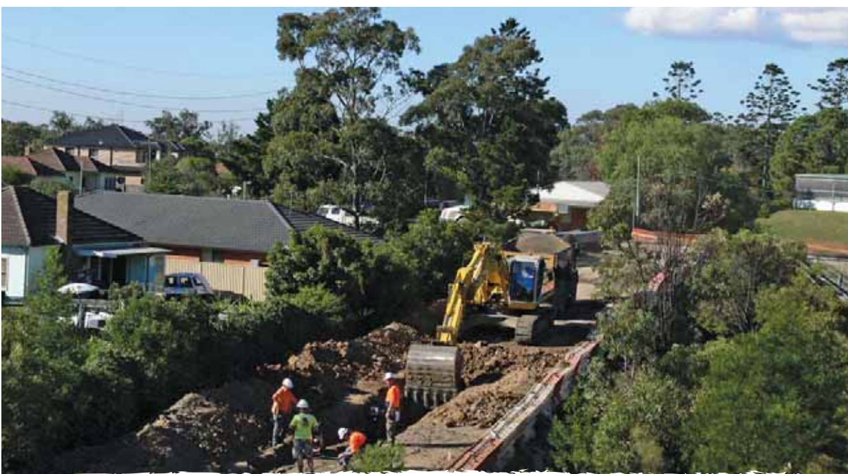
Works can be close to neighbouring residences