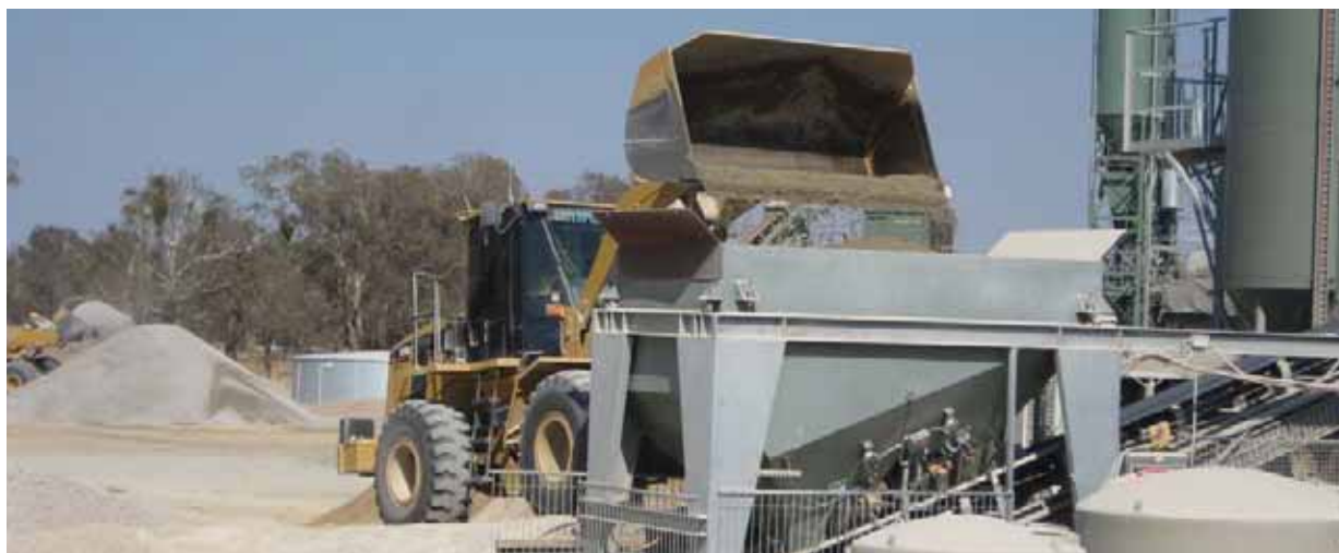
A loader fitted with a broadband reversing alarm rather than a beeper alarm (Abigroup Contractors Pty Ltd)

When a movement alarm is replaced by a less annoying audible movement alarm, all site personnel should be advised of this change and the manner in which the device functions. 1