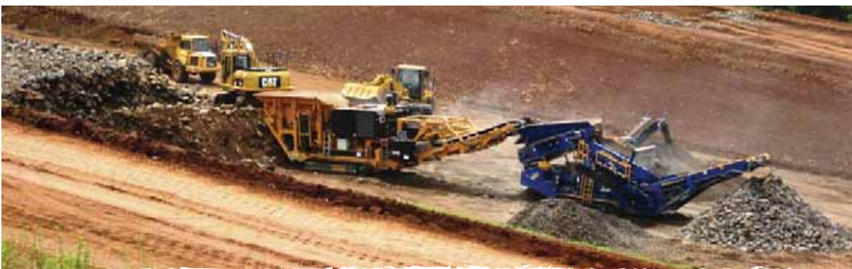
Equipment may move along as the project progresses (RTA)