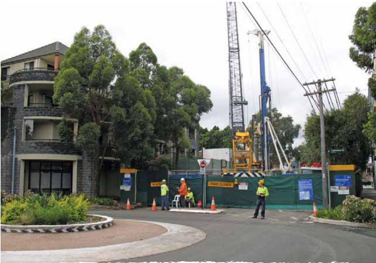
Consider bored piling to reduce noise and vibration (DECC)