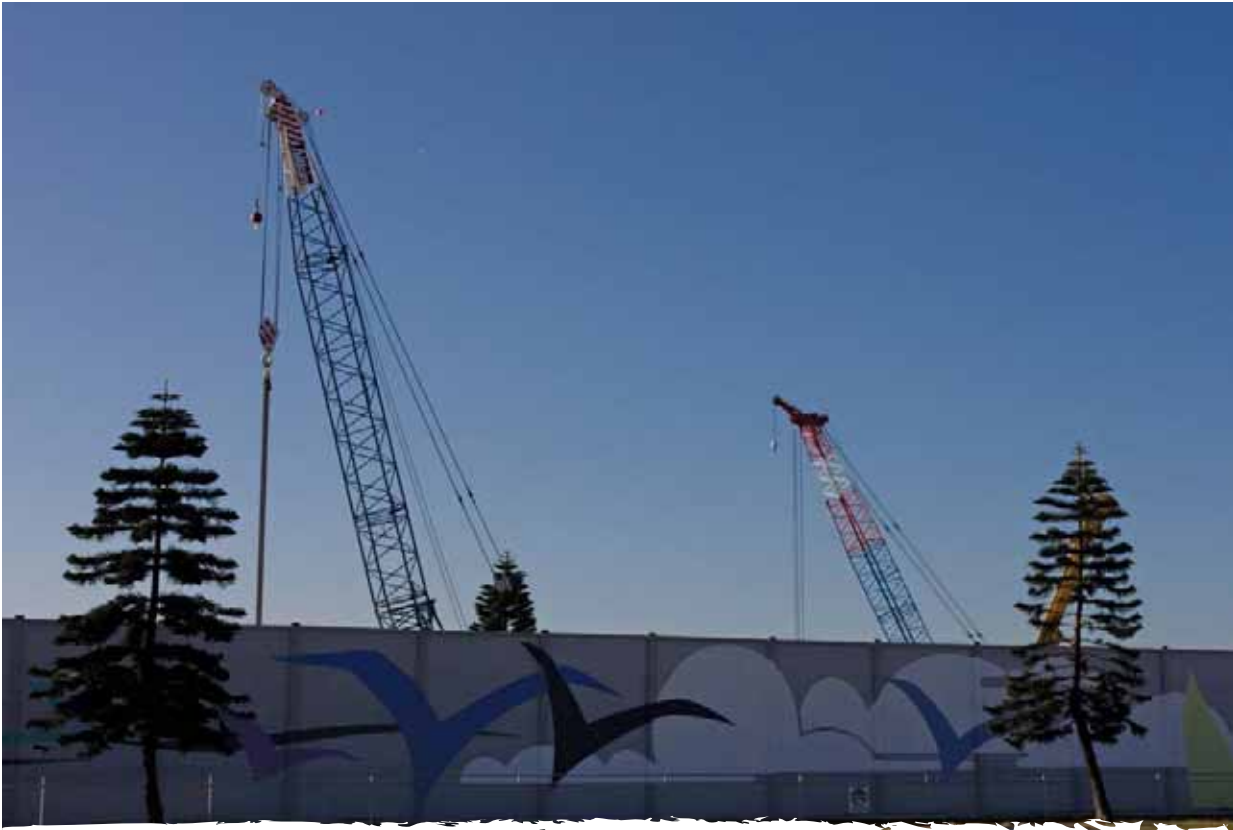
Temporary noise barriers around a pipeline worksite

The regulatory authority may review the information on feasible and reasonable work practices provided by the proponent, and compare the proposed practices against those applied on other similar projects. The regulatory authority may negotiate additional work practices that it considers may also be feasible and reasonable.