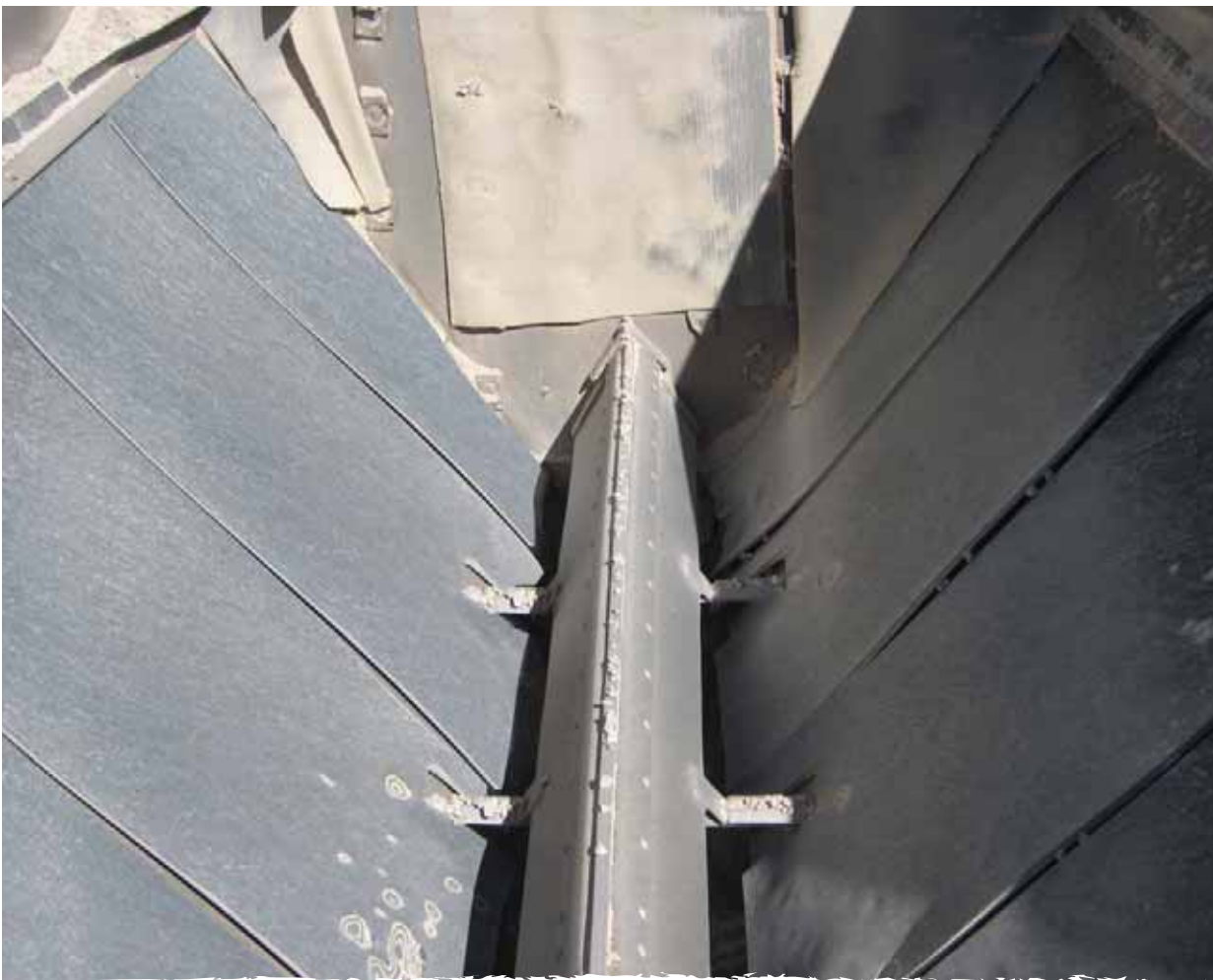
Reduce noise from chutes and bins by lining with damping material (Abigroup Contractors Pty Ltd)

Step 3: Apply the applicable universal work practices described in Table 4, as well as the selected feasible and reasonable work practices.