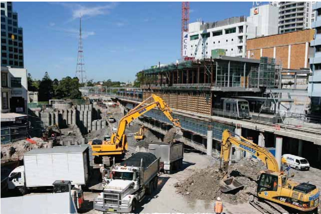
A quantitative assessment usually suits complex works (Transport Infrastructure Development Corporation)

People's reaction to noise from construction will depend on the time of day that works are undertaken. Residents are usually most annoyed by work at night-time as it has the potential to disturb sleep. Noise from work on evenings, Saturday afternoons, Sundays and public holidays can also be annoying to most residents as it may interrupt leisure activities.