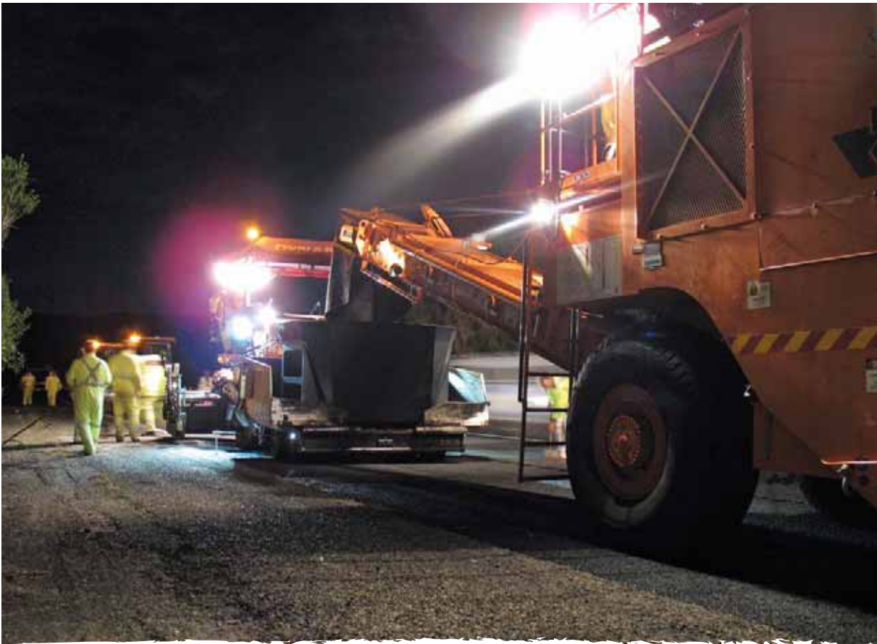
Consider respite periods for high-noise level works (DECC)

The project manager prepared a letter to residents surrounding the work area informing them that noise from the proposed works may be audible; a sample notification letter is shown in Figure 3. The project manager organised a toolbox talk each night with the workers before work commenced, to explain to them the importance of minimising the noise on site. The project manager also arranged for the site manager for each night to carry a mobile phone and be the point of contact for community enquiries or complaints.