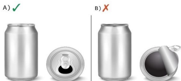
A) An eligible metal container with a stay-tab opening B) A prohibited removable 360-end lid

Metal cans must not have a lid that is completely removable upon opening, such as 360-end cans or old-style ring-pull/pop-top tab lids where the tab is removable. Removable lids do not include twist tops and the popular stay-tab mechanisms.