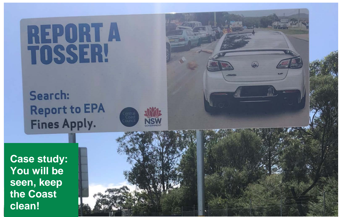
Report to EPA signage at Somersby Industrial Park

Central Coast Council aimed to decrease roadside littering behaviour through building community ownership.