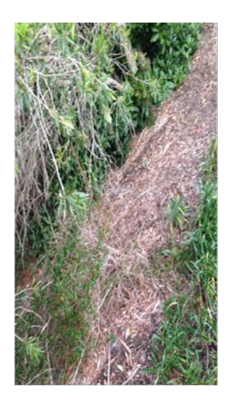
Blue Haven after implementation of the program

The EPA's easy-touse Local Litter Check is a free online tool to help understand your local litter problem. Details can be found on the EPA website.