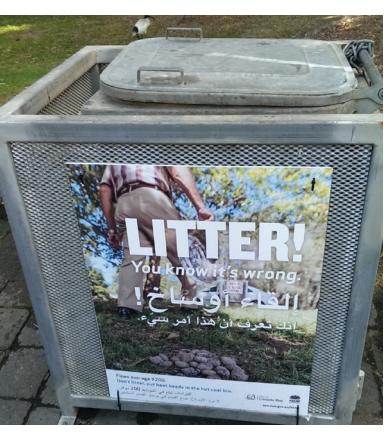
Relocation of hot coal bin to more accessible location with appropriate signage