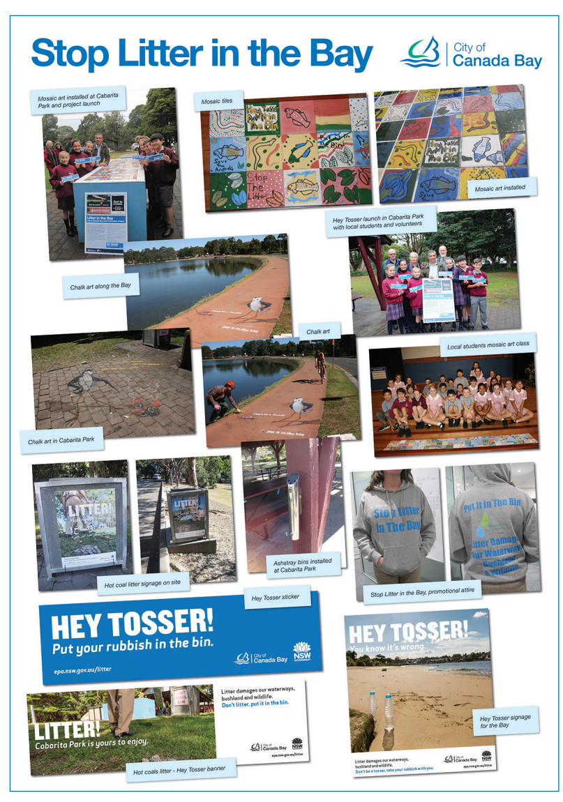
Locally tailored litter campaign material