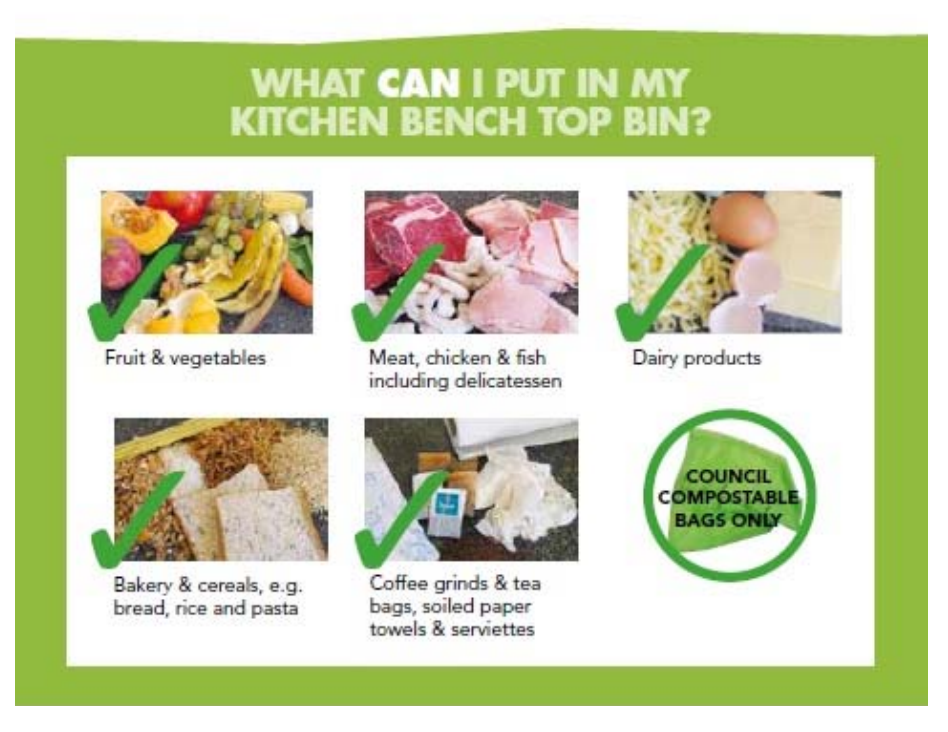
Figure: Example of updated education material