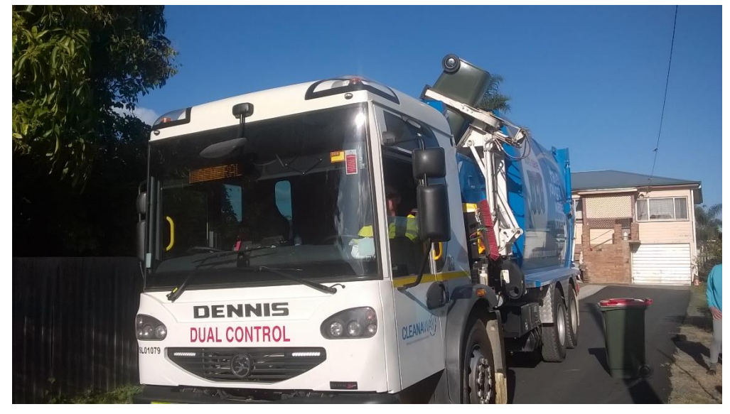
Council changed the red bin collection from weekly to fortnightly across the entire LGA.

Together these initiatives reduced the amount of waste going to landfill by an estimated 15% in the first year. This positive result has been maintained to date.