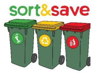
The educational campaign was well received by residents.

The EPA's Organics Collections Grants provide up to $1.3 million to councils and business to introduce new food only or food and garden collection services. They are administered by the NSW Environmental Trust and are open for applications over several funding rounds.