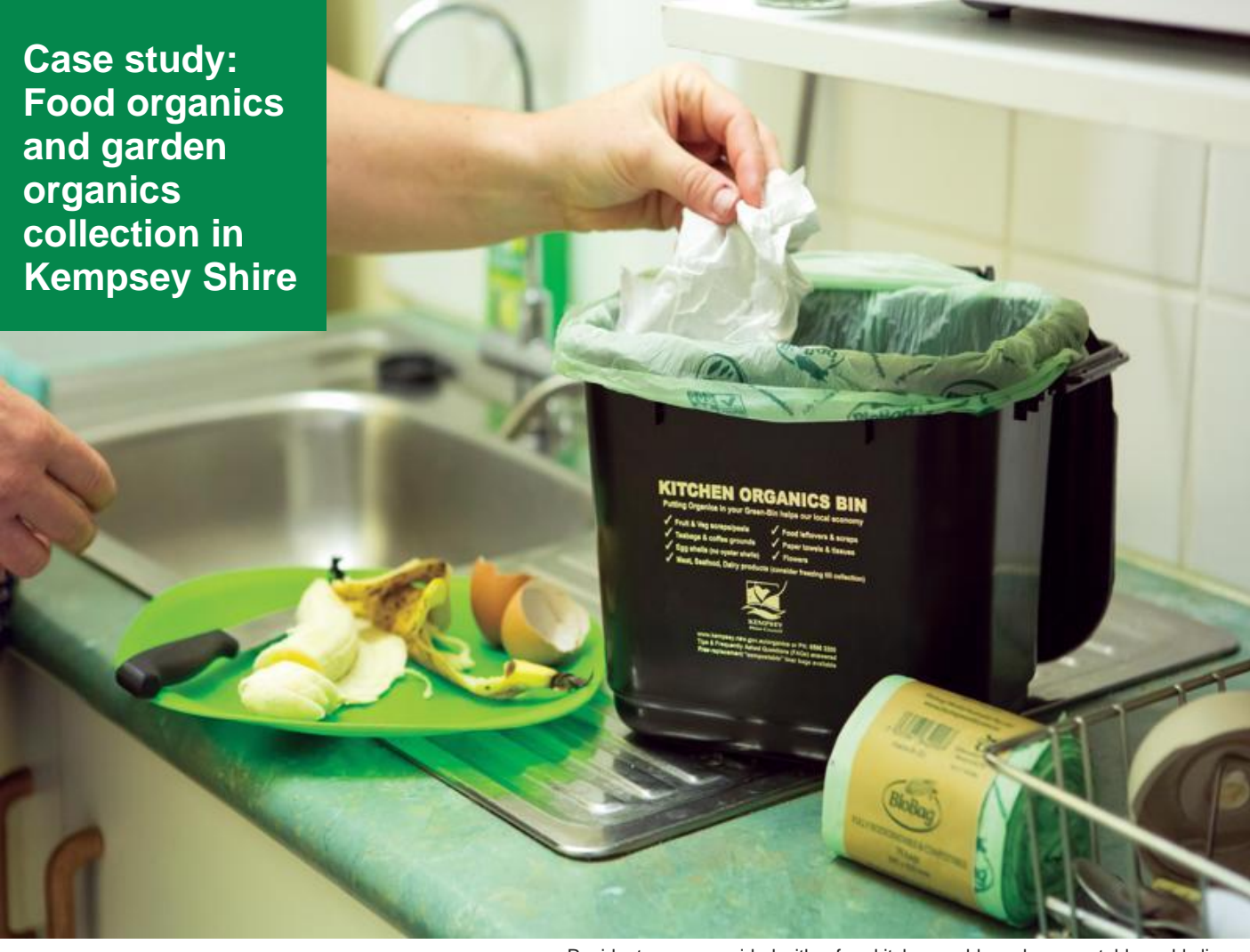
Residents were provided with a free kitchen caddy and compostable caddy liners.

"We have seen a lasting improvement of a 15% increase in our landfill diversion and reduction of our waste levy payments each month."