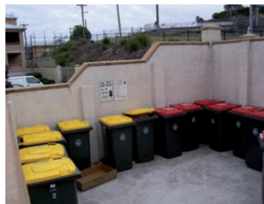
Recycling and garbage bins in the external storage area