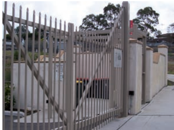
External storage area located behind the locked gates

As it is a requirement that the bin presentation area is located on site, the appropriate security access must be provided for collection operators to enable them to access the area. Therefore, the collection operators have been provided with remote control access to the development.