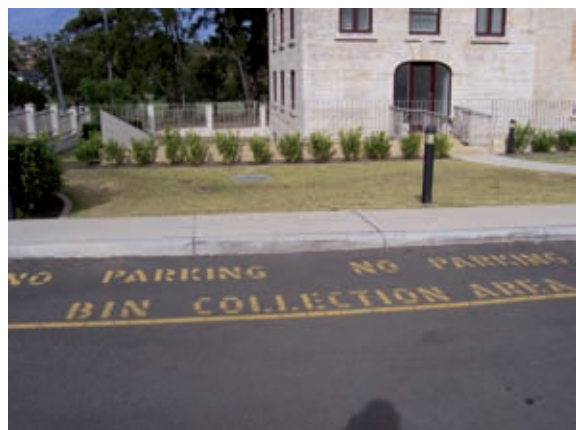
Close up of street markings indicating the bin collection area