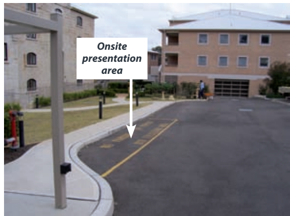
Bin presentation area located onsite in a position that should not interfere with general traffic flow