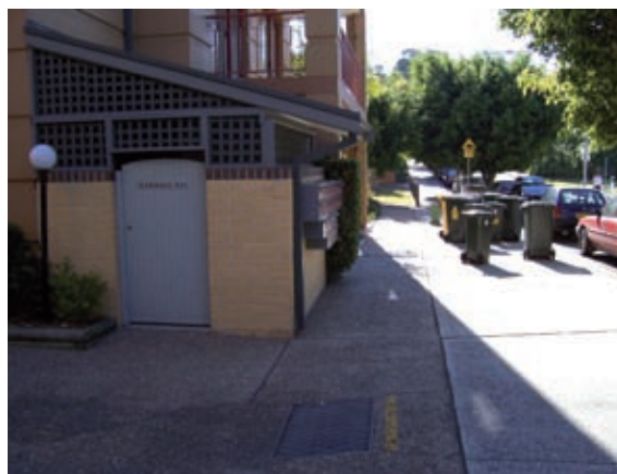
One of the communal storage areas located at the front of the property, adjacent to resident mailboxes and the driveway entrance

All garbage and recycling MGBs are colour coded and display stickers to show whether they are for garbage or commingled recycling.