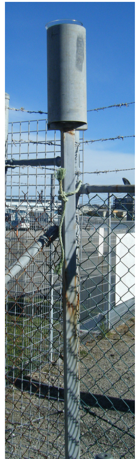
Dust deposition gauge

AECOM is looking for sites to locate dust deposition gauges for 12 months of monitoring. The sample sites will be selected based on the distribution and intensity of complaints received by the EPA regarding air quality over the last two or three years, as well as sites along the rail corridor.