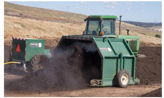
Photo: Household FOGO waste is converted into nutrient-rich compost. (Cooma-Monaro Shire Council)