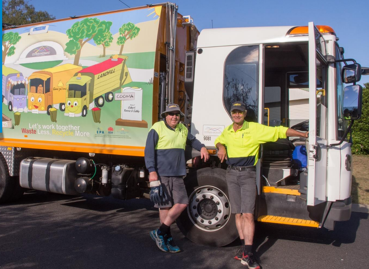
Photo: Fun branding is used to educate children about waste and sustainability.

Home to a population of 10,114 people, the Cooma-Monaro area in south-east NSW is set among the rolling Monaro plains and Snowy Region peaks about 100 kilometres south of Canberra.