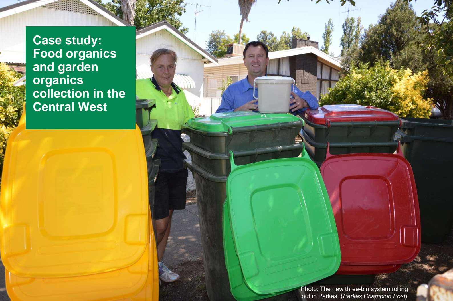
Photo: The new three-bin system rolling out in Parkes.