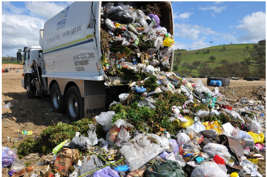
Photo: Bathurst landfill waste before the service was introduced.

‘I think it’s been wholly successful and it’s been quite well received by the community.’