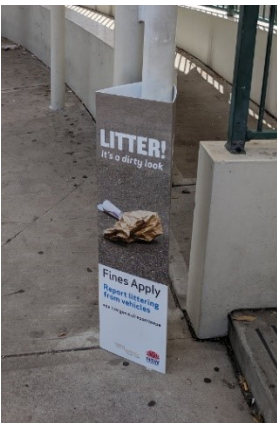
EPA bollard signs were used to highlight the message that littering leads to fines.

A campaign to reduce littering along major roads in the Hunter region resulted in a 69% reduction in litter. The initiative was designed after the Hunter Region Regional Litter Plan 2016-21 identified arterial roads as a priority.