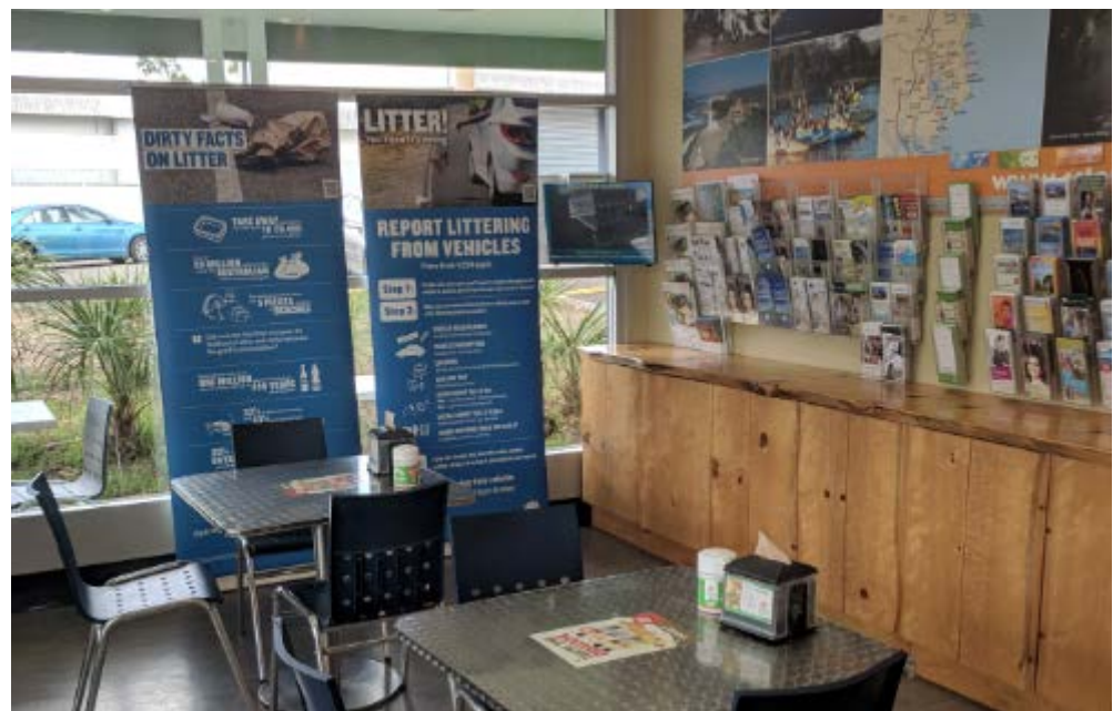
EPA anti-littering banners in a service station dining area.

Awareness of litter was raised as a significant issue across the community.