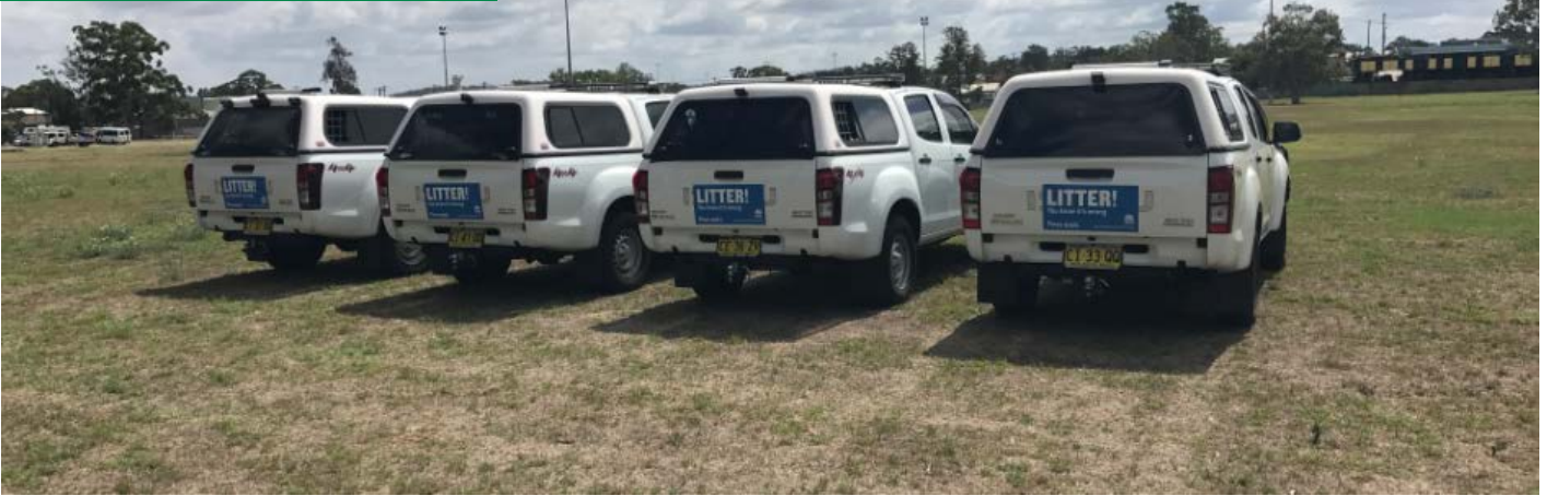
Ranger vehicles on display with EPA stickers.

Roadside service stations were keen to support litter reduction programs.