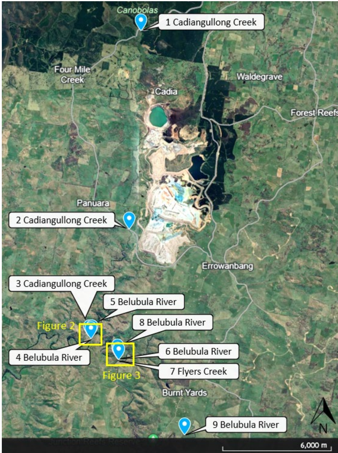
Figure 1 Overview of the sampling sites