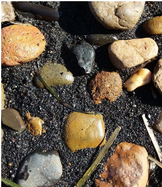
Annexure B – Metallurgical slag on soil surface (top), as in-fill below topsoil (bottom left) and zoomed metallurgical slag on soil surface impacted soil (bottom right)

While metallurgical slag has been observed at ground level, it is more common as in-fill material located 150-200 mm below ground level with a layer thickness up to about 200 mm. Metallurgical slag is discernible from flue dust by its black colour. Slag impacted soil will have a black colouration associated with it rather than an ordinary brown appearance of flue dust impacted soil.