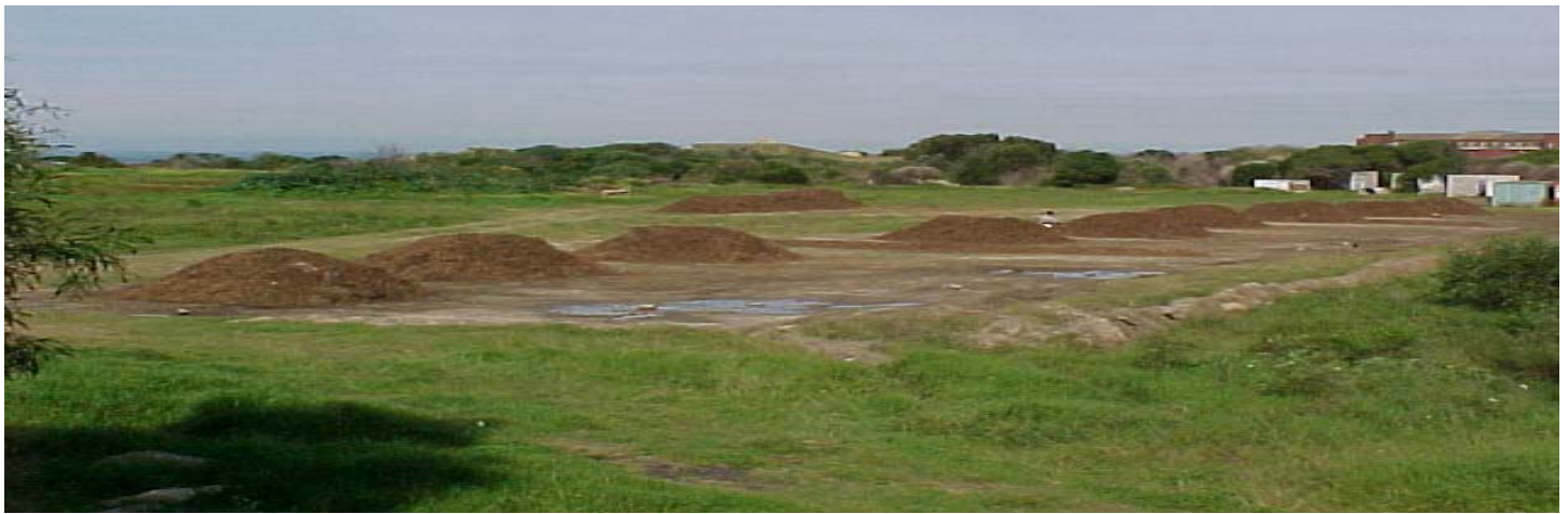
Figure 1. Herbicide degradation trial site. Breakdown of herbicides was evaluated in three separate replicated treatments to assess the degradation of herbicide at differing concentration levels during the composting process. These were control (no added herbicide, left three piles), low herbicide (middle three piles) and high herbicide levels (right three piles).

The scientific trial comprised of nine, six tonne static piles of shredded garden organics, dosed with low and high levels of the three herbicides (Figure 1).