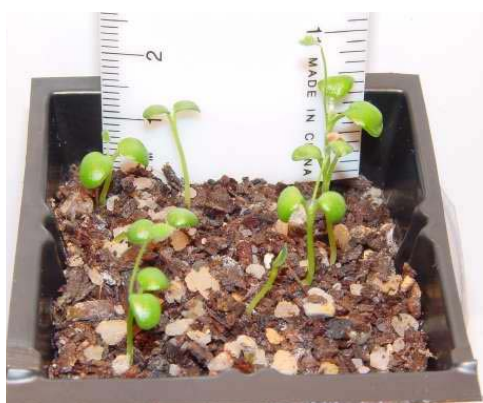
Red clover bioassay test for detecting persistent herbicides in compost.

Over 600,000 tonnes of organic material, comprising mainly garden organics, is diverted from landfill and processed into a range of valuable materials in NSW every year 1 .